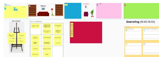
Fig. 4: Extract from the DIU team meeting template (mural)

Digital whiteboards can be designed according to the theme. There are hardly any limits to creativity. It is advisable to place an agenda or an overview plan at the beginning and to link from there to the relevant exercises, tasks, information, recommendations, etc. on the board so that it is as easy as possible for users to find their way around the board. A test beforehand is useful to make sure that everything is fixed that belongs to the structure of the board and that the links on the board work. If there are many participants on the board, it can otherwise become chaotic.