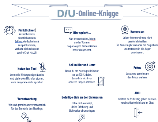
Fig. 2: Online etiquette of the DIU

Of course, this does not mean playing too many games and forgetting about learning. Good planning of the icebreaker phase is essential. This applies equally in the analogue, hybrid and digital learning space. If certain tools and methods are to be used, enough time should be planned to introduce and explain them calmly. This should not be underestimated, because cooperation can only work well if everyone is familiar with the application.